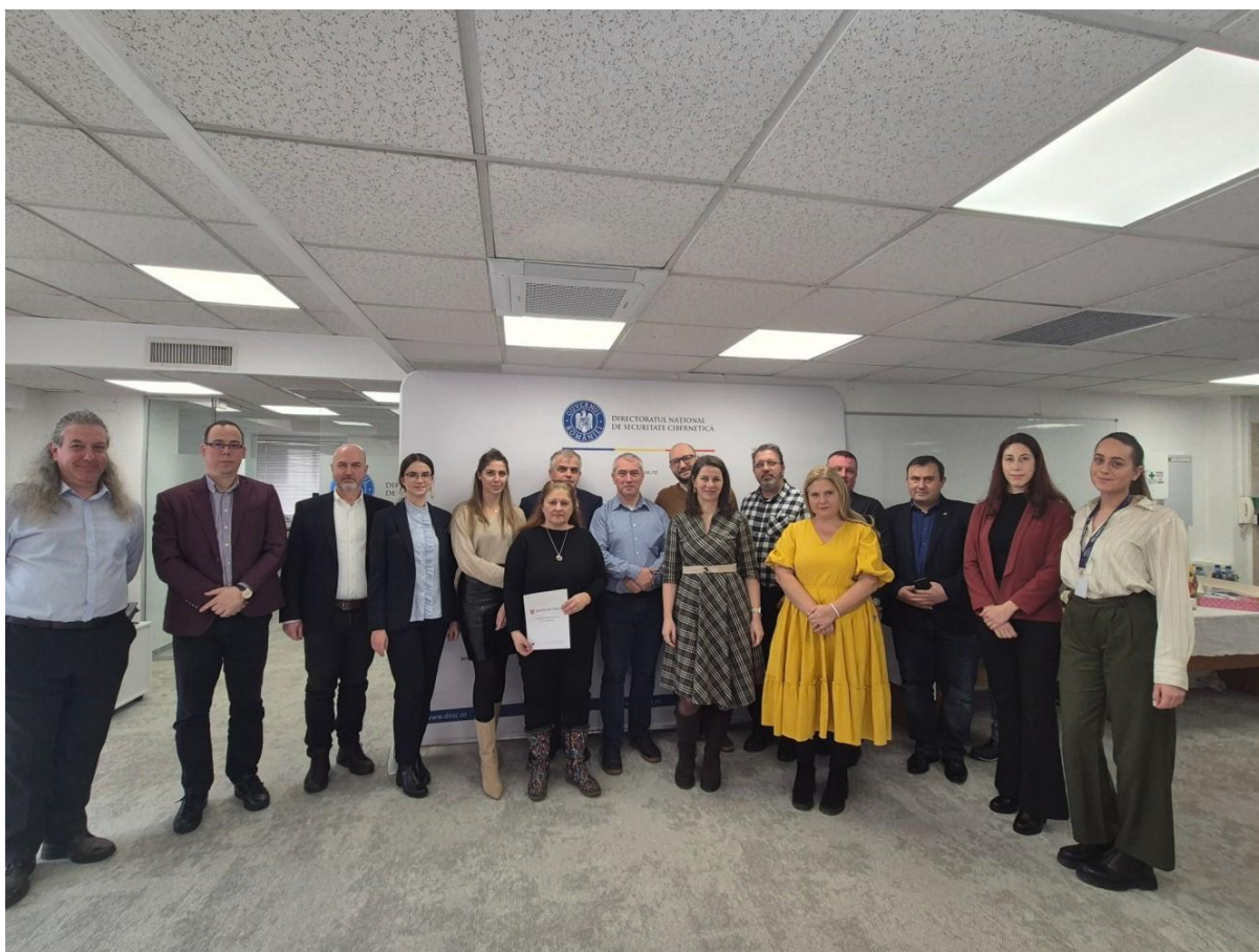
First national workshop in Romania, 17 December 2024