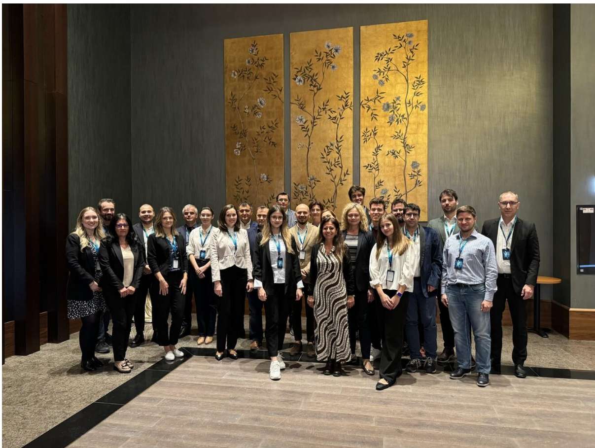
ENDURANCE project partners in Timisoara (Romania), 15 October 2024

Driven by the need to fortify Europe's essential services, ENDURANCE embarks on a three-year journey to develop methodologies, interoperable technologies, and pragmatic strategies for enhancing resilience.