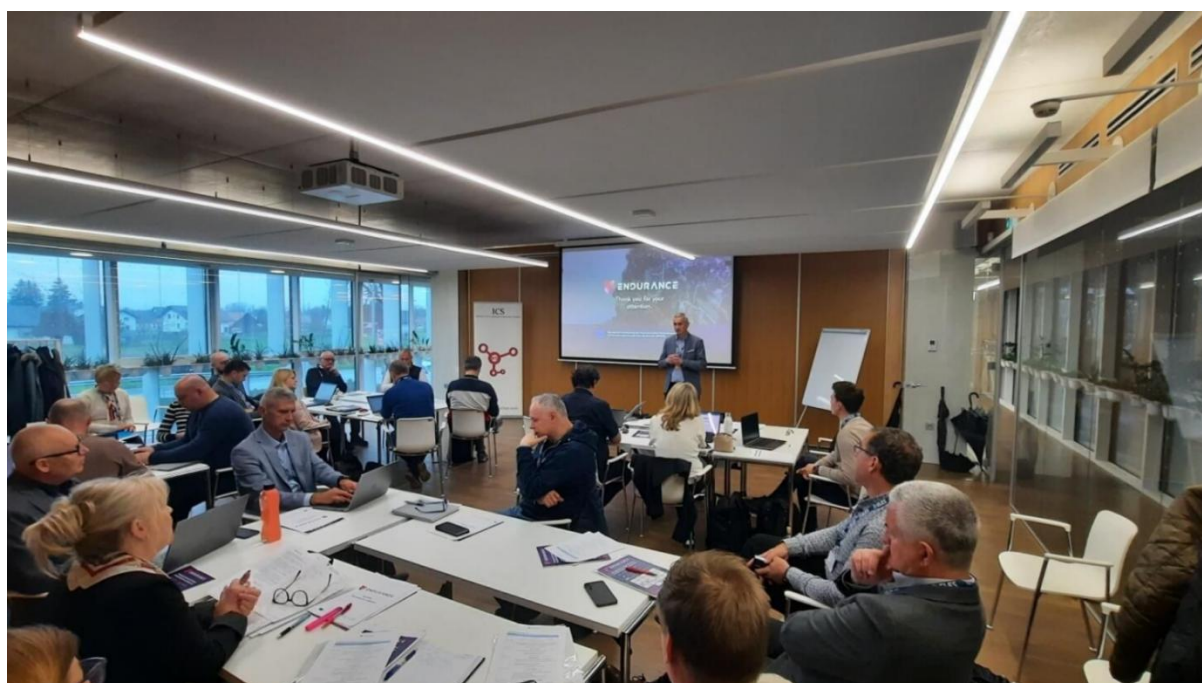
First national workshop in Slovenia, 27 November 2024