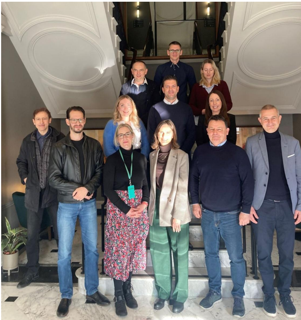
SUNRISE and ENDURANCE representatives in Dublin (Ireland), 4 February 2025

The insights gathered during the workshop will serve as a foundation for continued collaboration between SUNRISE and ENDURANCE in the months ahead.