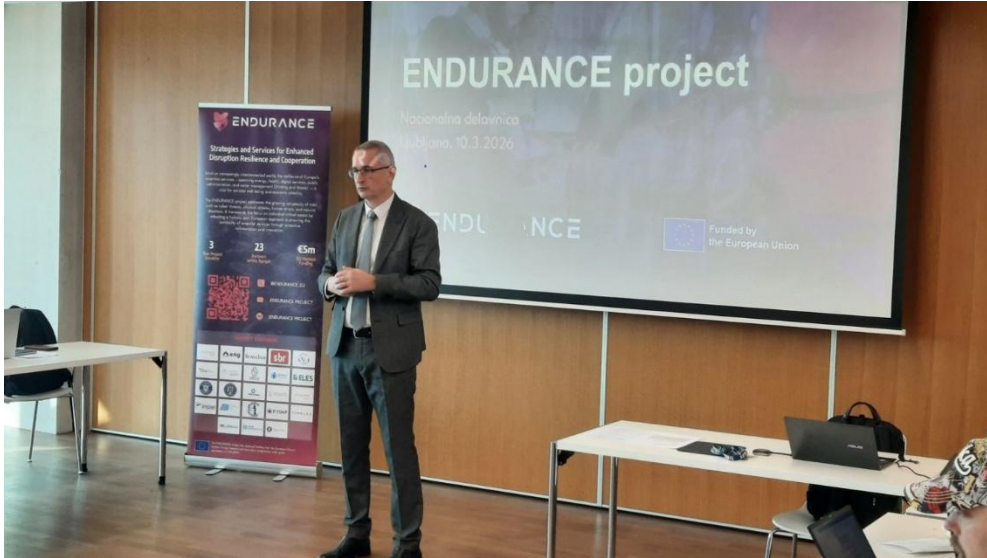
Slovenian Workshop on 10 March 2026