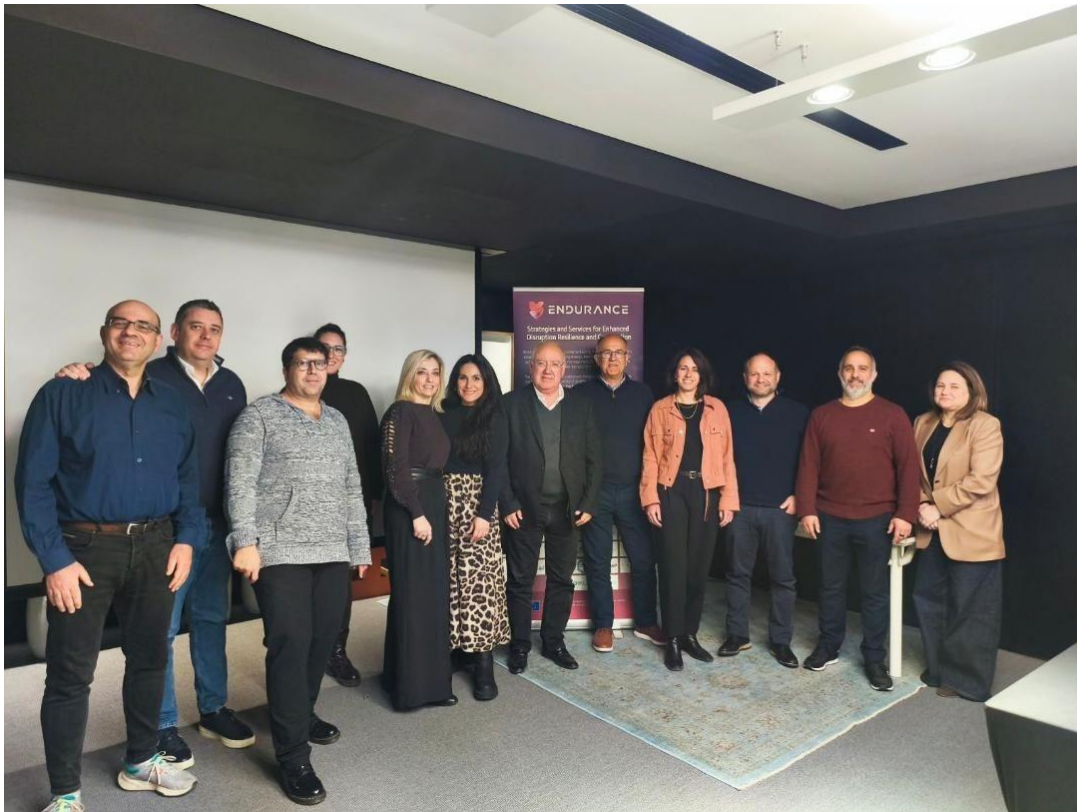
Greek Workshop on 19 March 2026

national challenges and innovative pilot solutions, including early-warning systems for drought detection.