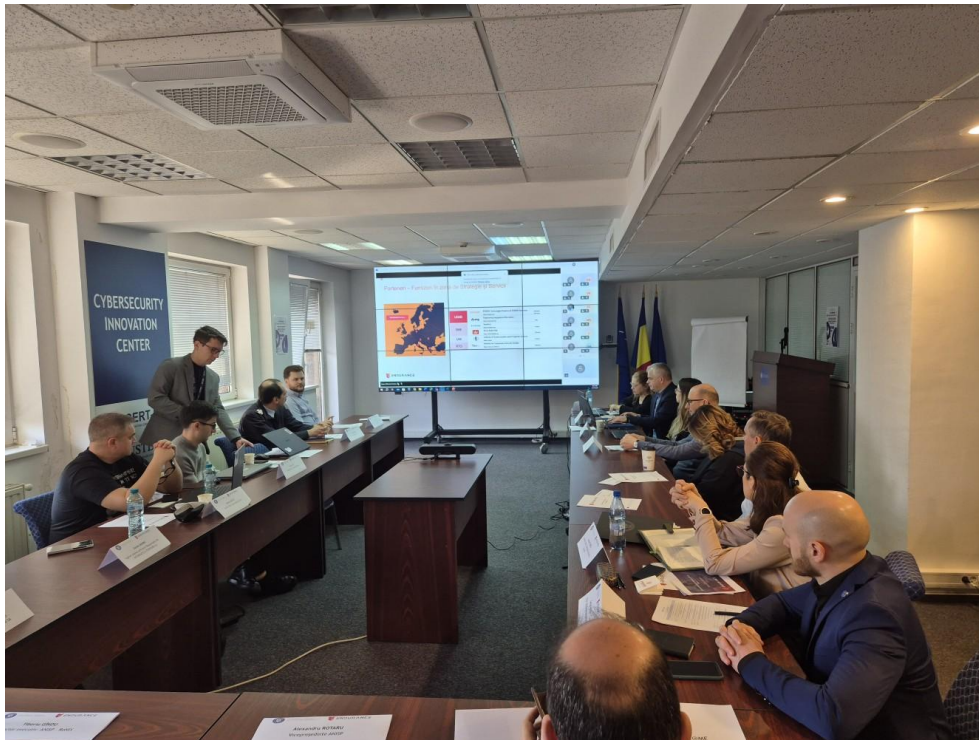
Romanian Workshop on 17 March 2026