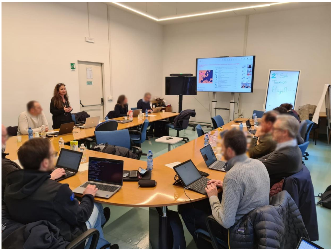
Italian Workshop on 6 February 2026